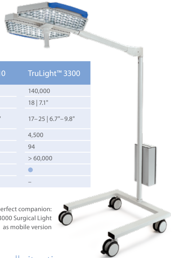
The perfect companion: TruLight™ 3000 Surgical Light as mobile version