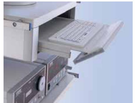
The heavy-load shelf with keyboard drawer makes it easy to document in the room; its handle-free design also makes it easy to clean